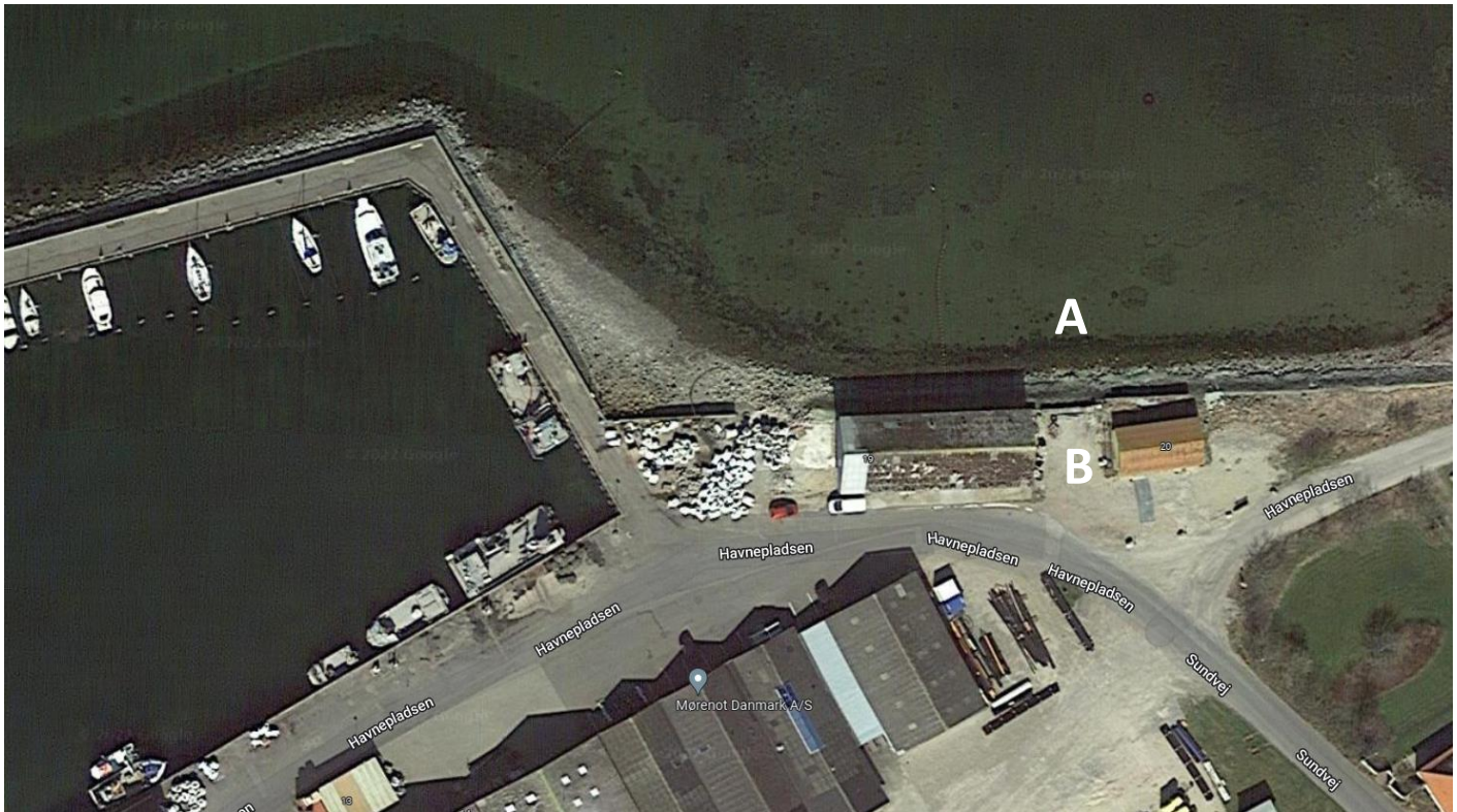
Figure 3 Areal photography showing site A and B at the Harbour of Hvalpsund